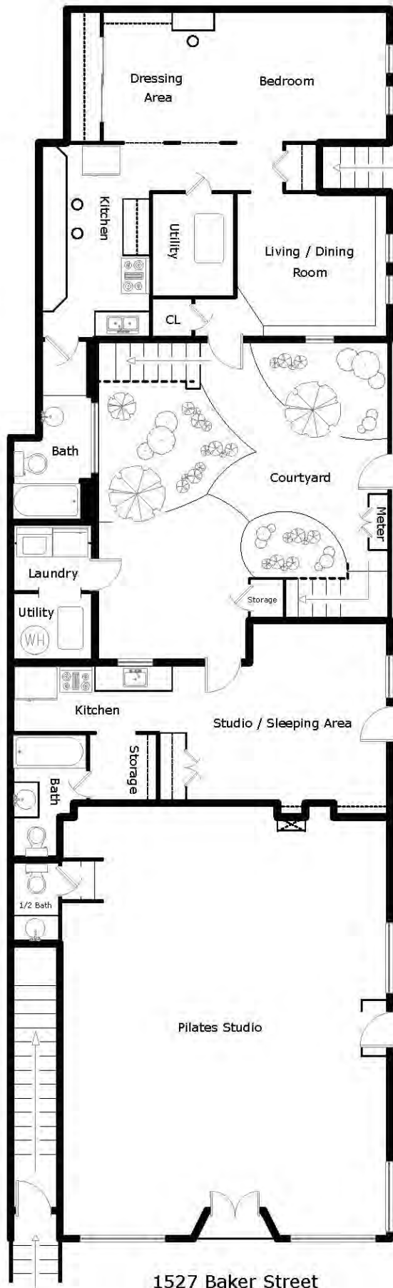
1527 Baker Street